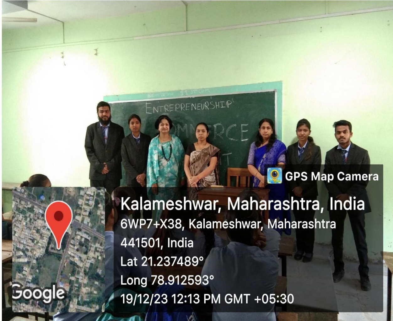
Students of Jain International Engineering College gave guidance on how to become an entrepreneur. 19.12.23