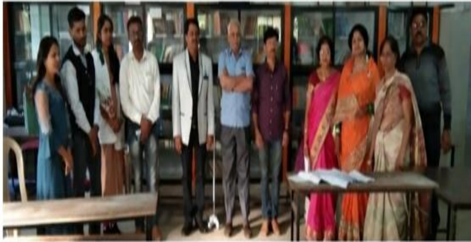
Cultural Activities —Doctors blood testing and eye checking camp for students on 24.12.20 .....